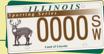
Deer License Plate