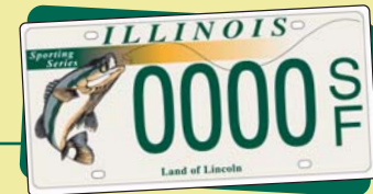
Bass License Plate