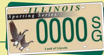
Goose License Plate