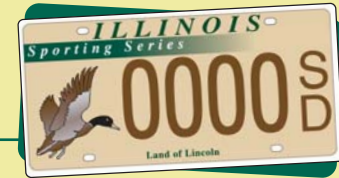
Duck License Plate