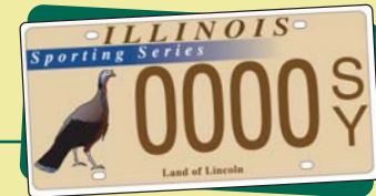
Turkey License Plate