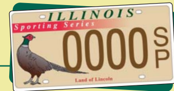
Pheasant License Plate